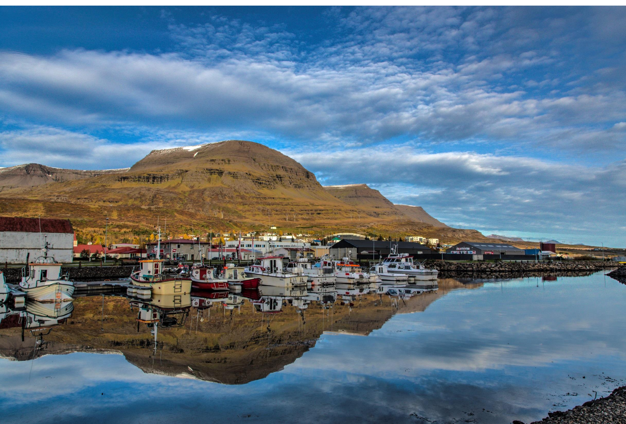
Reydarfjordur, welded rhyolite tuff