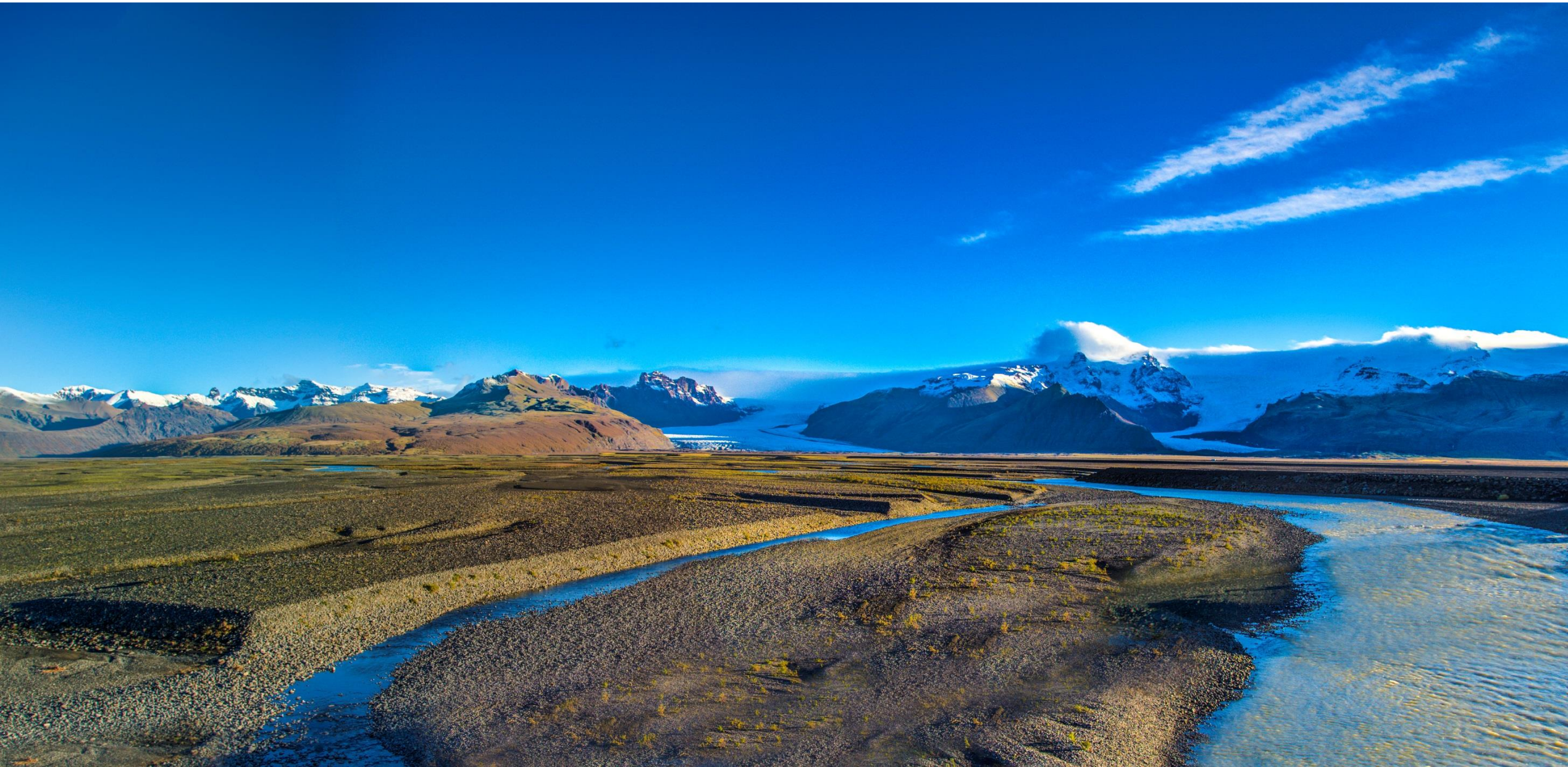
Skeidararsandur, largest glacial outwash plain and Oraefajokull & Hvannadalshnjukull, 2119m, Iceland 's highest