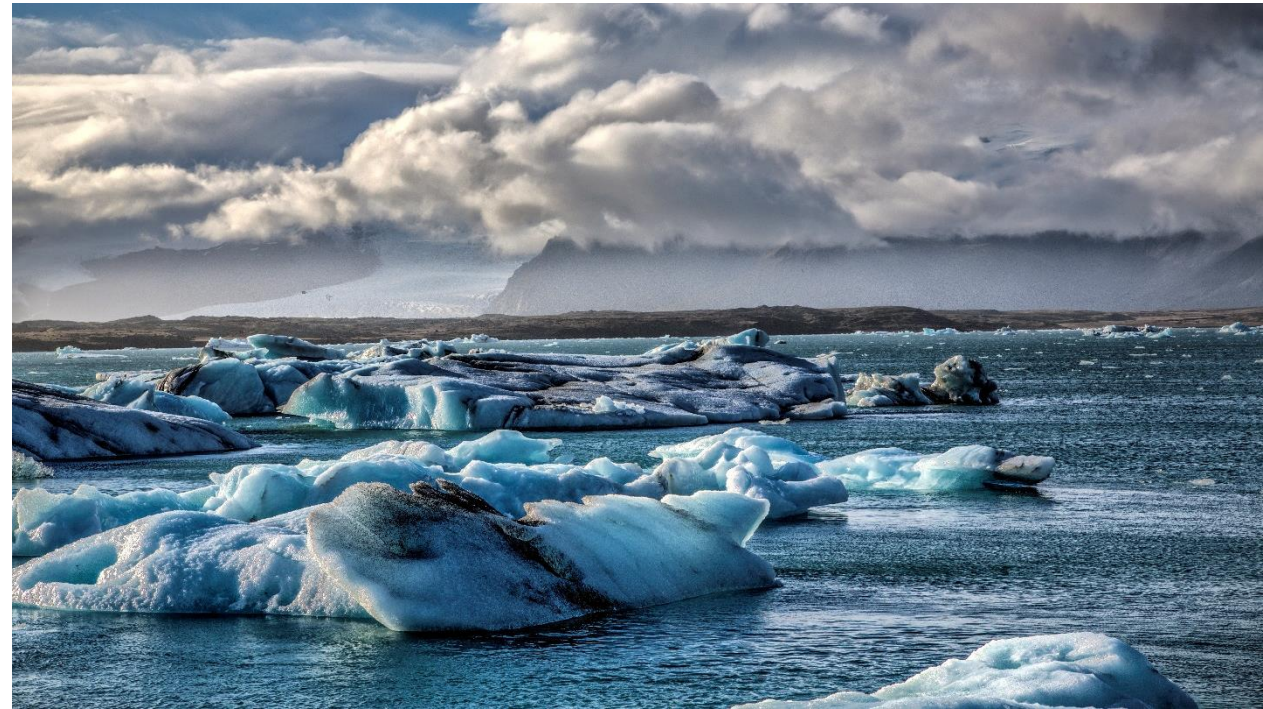
Jökulsárlón, glacial lake at base of Vatnajökull