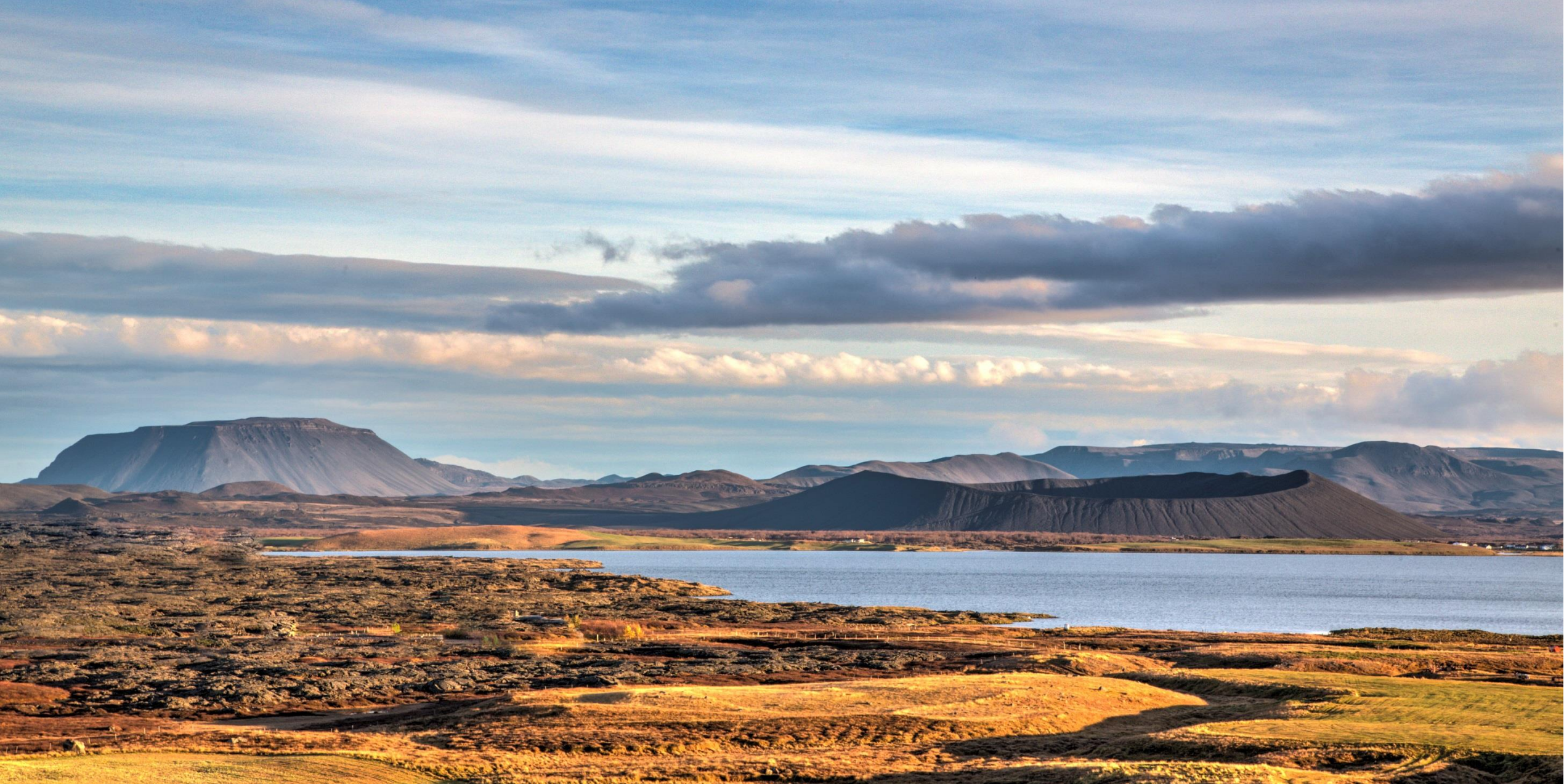
Overlook of Lake Myvatn, a paradise of volcanology, from the North. Shown in the background is the conical Hverfjall crater and the Ludent crater. The lava in the foreground is <0.8\text{Ma} (Upper Pleistocene).