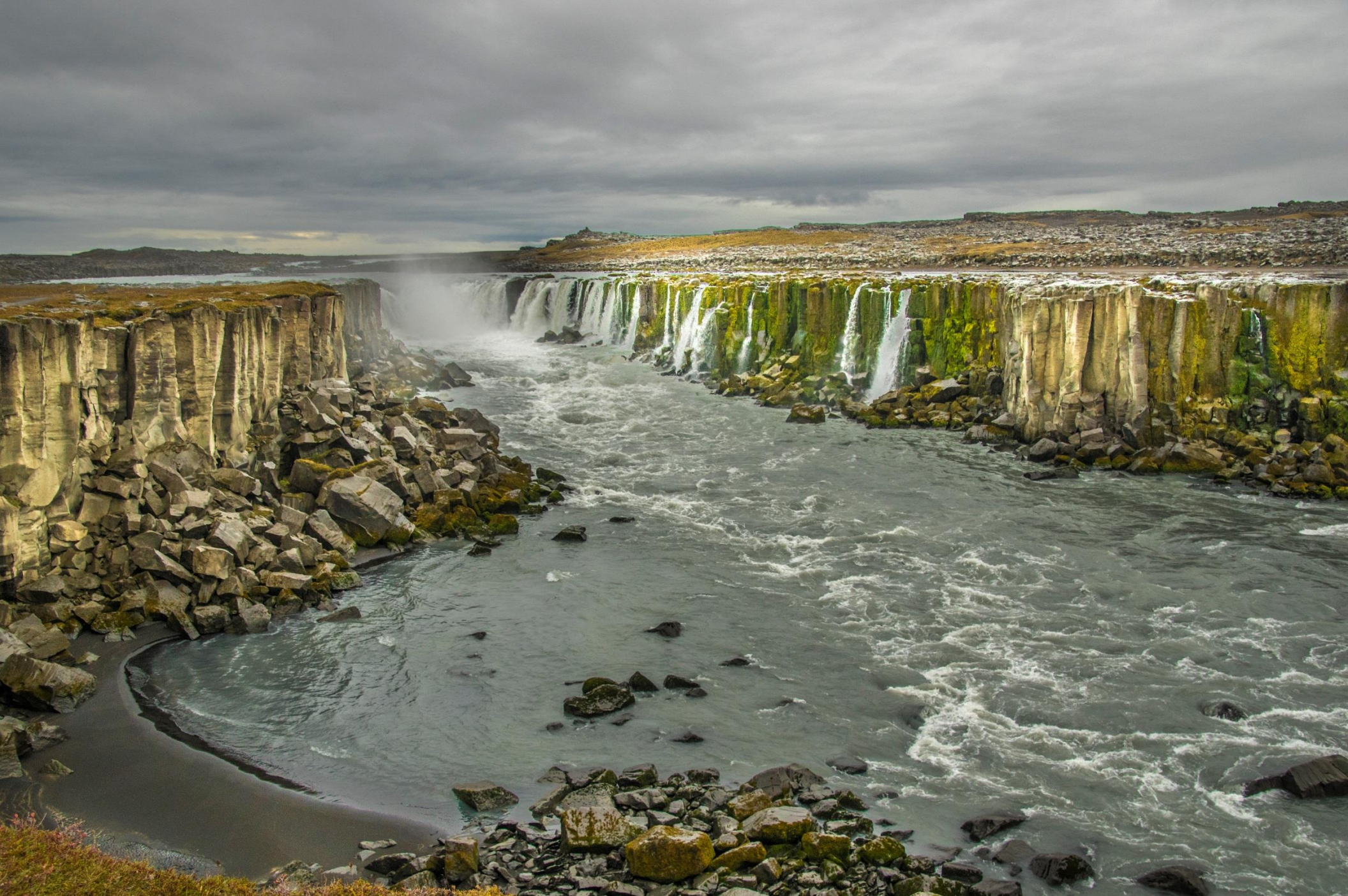
Selfoss next to Dettifoss