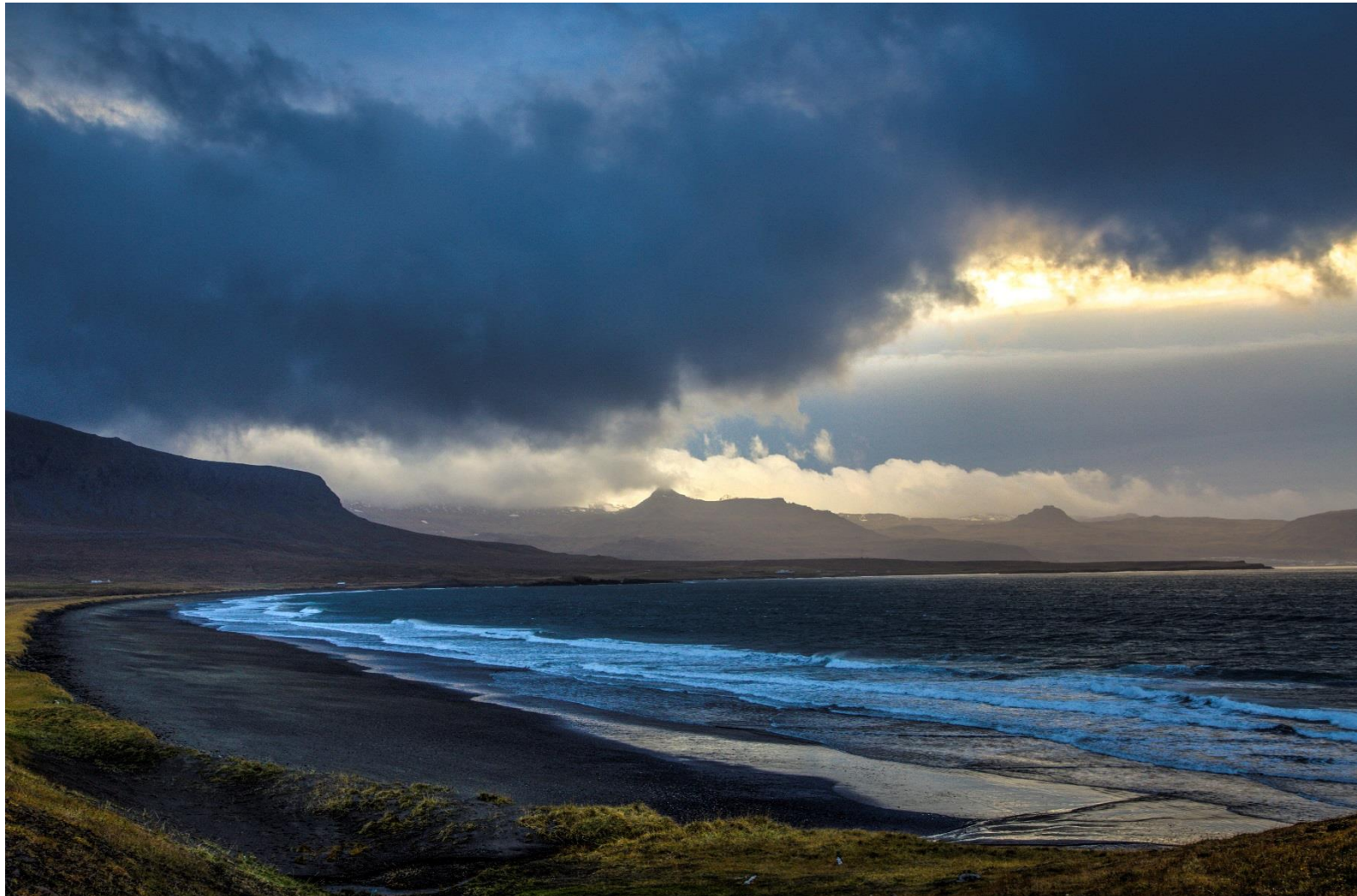
Black sand beach near Olaesvik