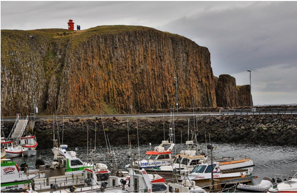
Snæfellsnes, Stykkisholmur and basalt columns

Arnastapi, Hellnar, Búðahraun, Eldborg á Mýrum, Borgarnes anticline, Hafnarfjall, end up in Reykjavik