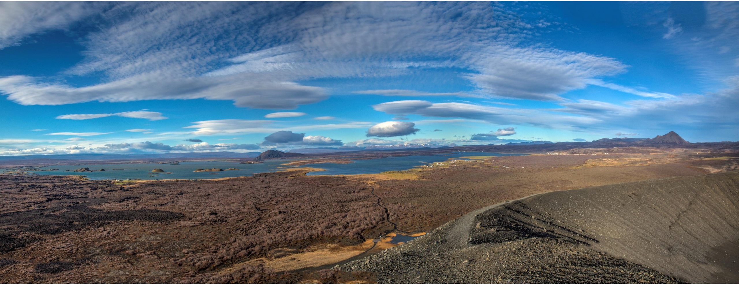
View of Lake Myvatn and rootless volcano cones from the Hverfjall Crater Rim