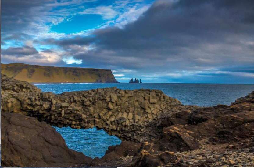
Dyrhólaey, southern most point in Iceland, cube jointed lava from water cooling. Myrdalsjokull in background