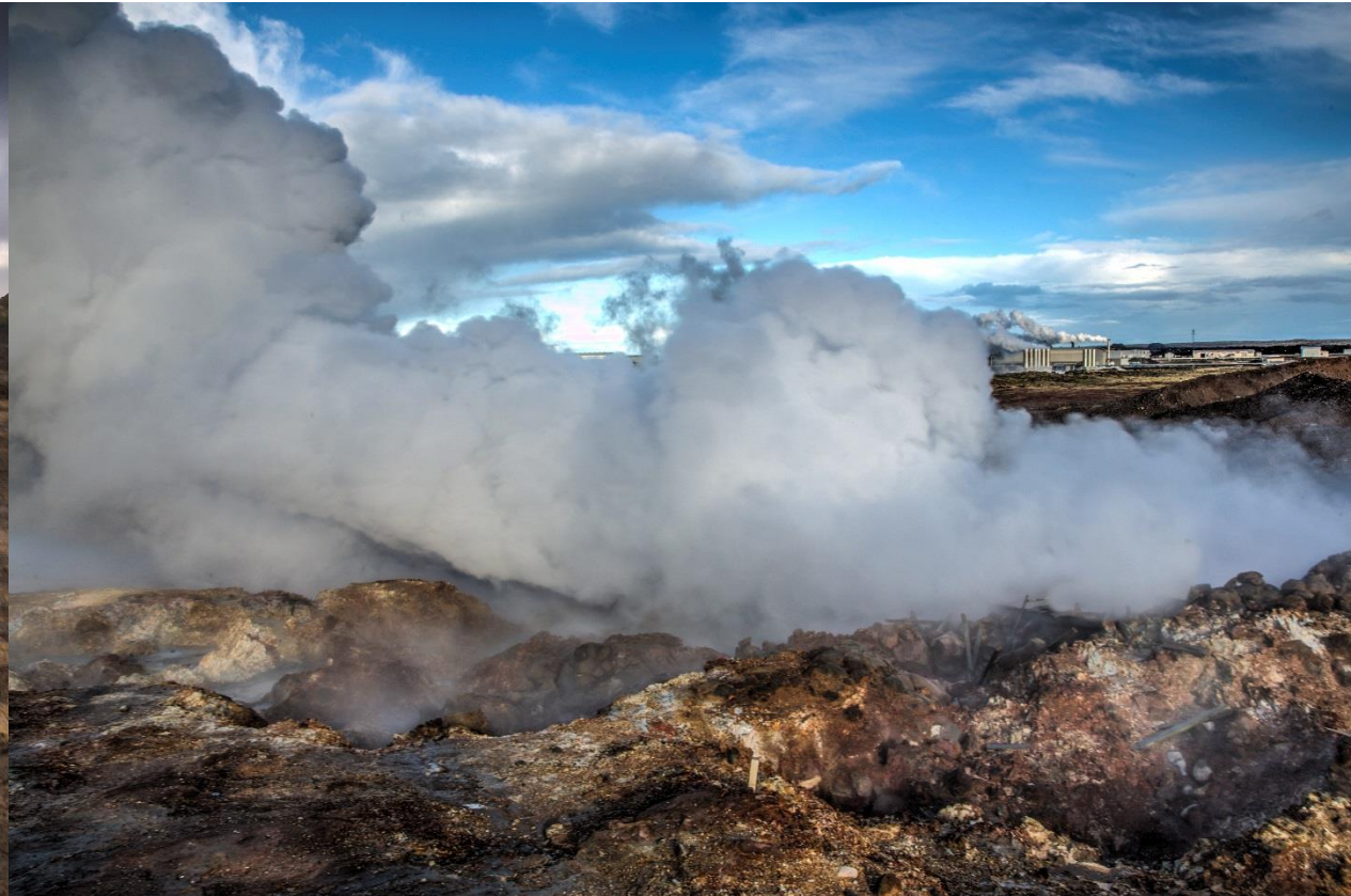
Gunnuhver thermal area with geothermal plant in background