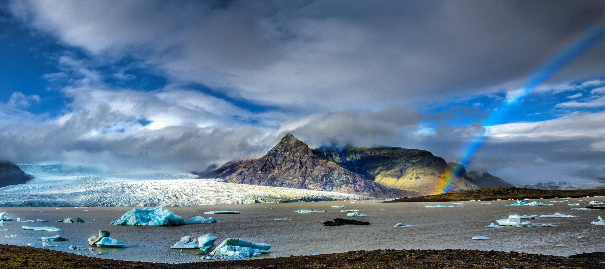
Fjallsarlon, glacial lake at base of Fjallsjokull, part of Vatnajokull