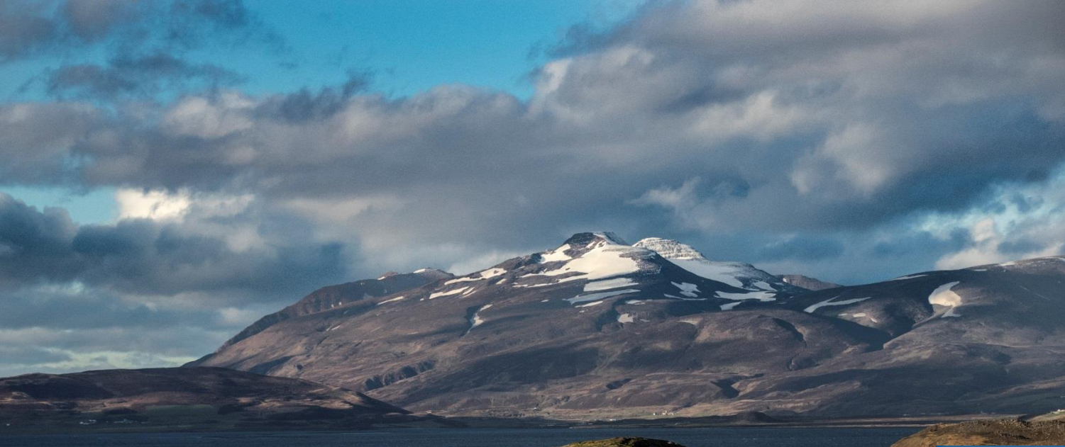
Husavik fishing village on Tjornes Peninsula