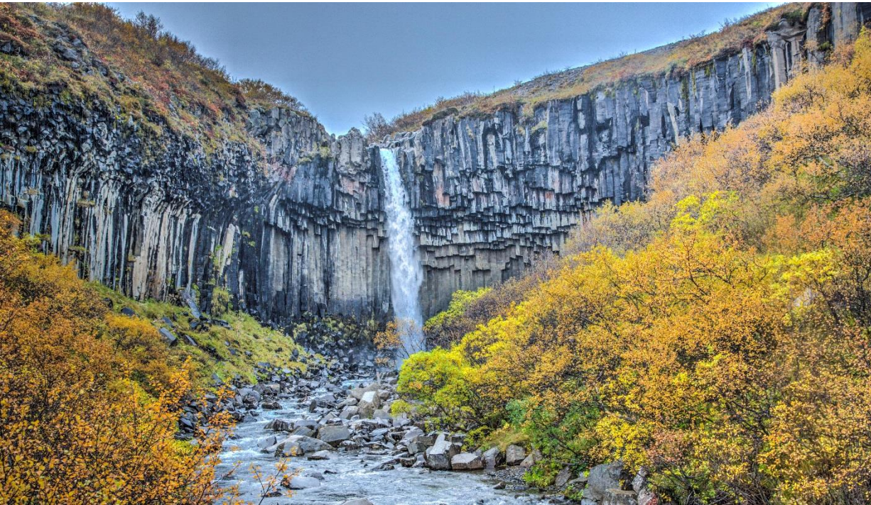
Svartifoss, Skaftafell National Park, basalt pillars

Day 8 enroute-Moore roots Almannaskarð, Slaufudalur, Lón, Eystrahorn.