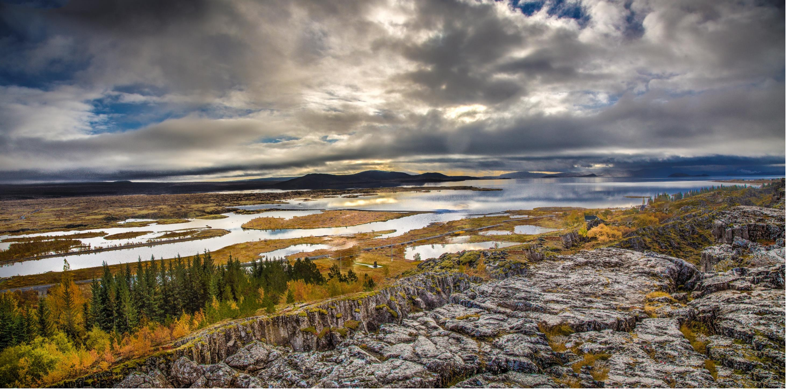
Lake Þingvallavatn, largest lake in Iceland, located in the 10-20km wide mid ocean ridge graben between the two normal faults bounding the rift