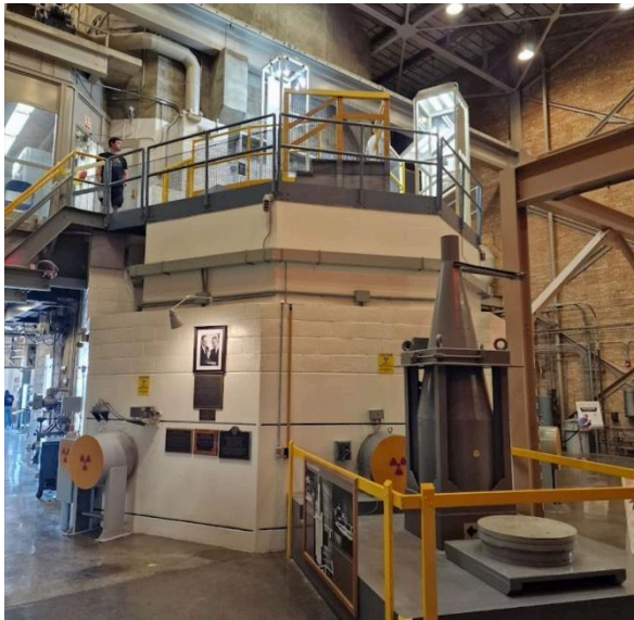
Experimental Breeder Reactor 1

The Geologists of Jackson Hole have arranged a visit to one of the United States research gems, the Idaho National Laboratory (INL) which is in Idaho Falls. INL is the national lab that does research on nuclear reactors, including the development of the first reactor (ERB-1) to produce electrical power and the reactors currently used by the US Navy. They also run the Advanced Test Reactor (ATR) since 1967, its primary function is to intensely bombard materials and fuels with neutrons to simulate long-term exposure to high levels of radiation, as would be present in a commercial nuclear reactor. The ATR is one of only four test reactors in the world with this capability. The reactor also produces rare isotopes for use in medicine and industry.